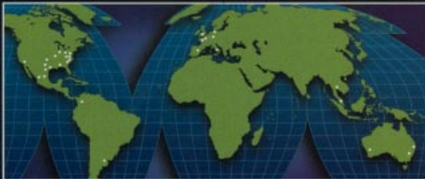
• YORK International Manufacturing Facilities

YORK International has earned ISO 9002 Certification, signifying compliance with international manufacturing quality standards.