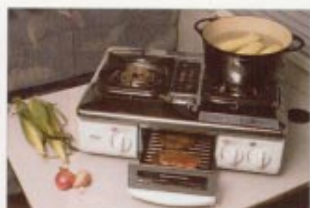
The Two Burner with Broiler