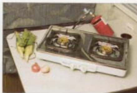
The Two Burner