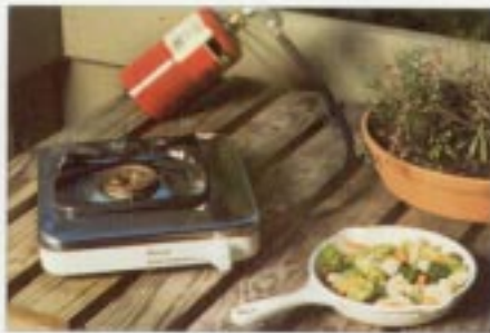
The Single Burner